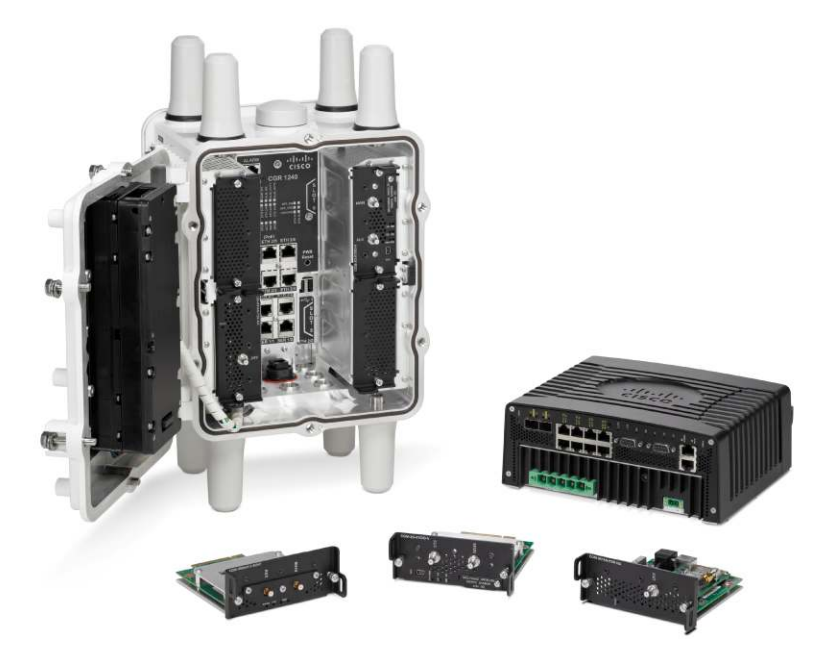
Figure 1. Cisco 1000 Series Connected Grid Routers

The Cisco CGR 1000 Series offers two platforms, shown in Figure 1. They include: The Cisco 1120 Connected Grid Router (CGR 1120), which is designed for indoor deployments; and the Cisco 1240 Connected Grid Router (CGR 1240), which is a weatherproof router in a NEMA Type 4 enclosure for outdoor deployments.