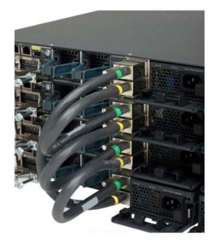
Figure 3. StackPower Connector

StackPower can be deployed in either power sharing mode or redundancy mode. In power sharing mode, the power of all the power supplies in the stack is aggregated and distributed among the switches in the stack. In redundant mode, when the total power budget of the stack is calculated, the wattage of the largest power supply is not included. That power is held in reserve and used to maintain power to switches and attached devices when one power supply fails, enabling the network to operate without interruption. Following the failure of one power supply, the StackPower mode becomes power sharing.