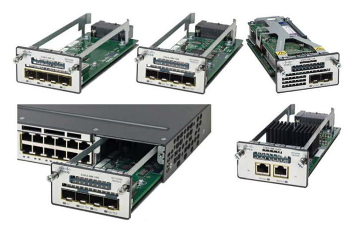
Figure 4. Network Modules with Four GbE, Two 10GbE SFP+ Interfaces, Two 10GB-T and Service Module with Two 10GbE SFP+ Interfaces

Figure 4 shows various Network Modules with Four GbE, Two 10GbE SFP+ Interfaces, Two 10GB-T and Service Module with Two 10GbE SFP+ Interfaces.