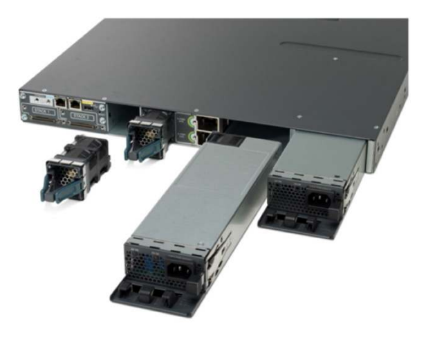
Table 6 shows the different power supplies available in these switches and available PoE power.