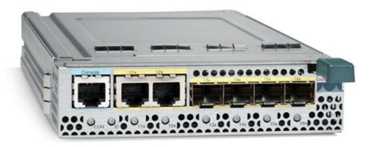
Figure 1. Cisco Catalyst Blade Switch 3040 for FSC

Designed for the Fujitsu Siemens Computers PRIMERGY Blade Server chassis, the Cisco Catalyst Blade Switch 3040 for FSC helps ensure consistency across the network for advanced services such as security and resiliency. It also allows customers to use the end-to-end Cisco management framework to simplify ongoing operations.