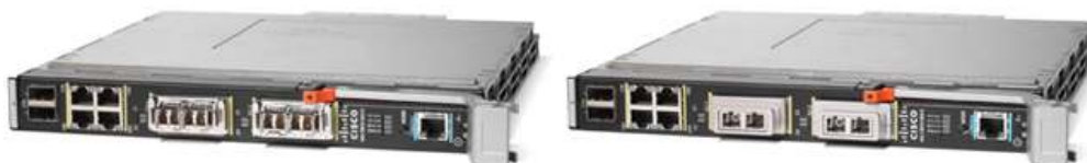
Figure 1. Cisco Catalyst Blade Switch 3130 for Dell M1000e

The Cisco Catalyst® Blade Server 3130 represents the next-generation networking solution for blade server environments. Built on the market-leading Cisco® hardware and Cisco IOS® Software, the Cisco Catalyst Blade Switch 3130 (Figure 1) is engineered with unique technologies specifically designed to meet the rigors of blade server-based application infrastructure. Specifically, the switch is designed to deliver scaleable, high-performance, highly resilient connectivity while supporting ongoing IT initiatives to reduce server infrastructure complexity and total cost of ownership (TCO).