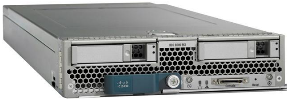
Figure 1. Cisco UCS B200 M3 Blade Server

The Cisco UCS B200 M3 Blade Server continues Cisco's commitment to delivering uniquely differentiated value, fabric integration, and ease of management that is exceptional in the marketplace. The Cisco UCS B200 M3 further extends the capabilities of Cisco UCS by delivering new levels of manageability, performance, energy efficiency, reliability, security, and I/O bandwidth for enterprise-class applications: