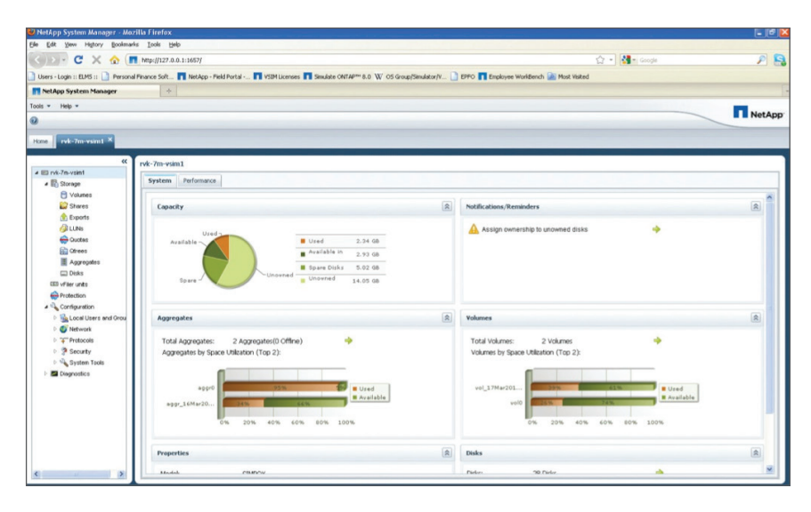
Figure 1) You don't need to be an expert to configure your storage with the simple, easy-to-use NetApp System Manager console.

• Protect your critical data more efficiently with integrated data protection by using NetApp technologies such as RAID-TEC<sup>™</sup> (triple-parity), RAID DP<sup>®</sup>, and Snapshot<sup>®</sup>.