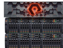
FIGURE 2: FlashArray//C60 capacity scaling